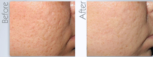
Acne Scars 2 Treatments, 60 Days Post Treatment