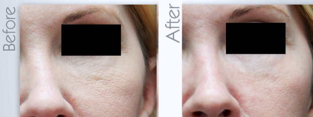
Fine Lines 1 Treatment, 7 Days Post Treatment