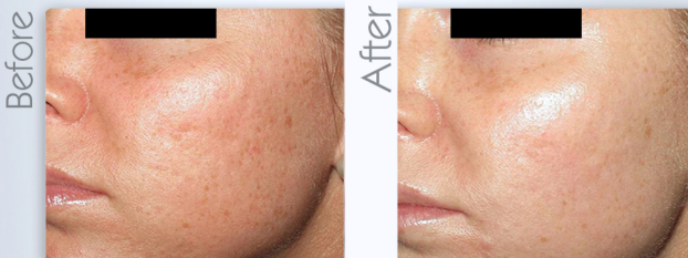
Pigmentation & Texture 2 Treatments, 60 Days Post Treatment